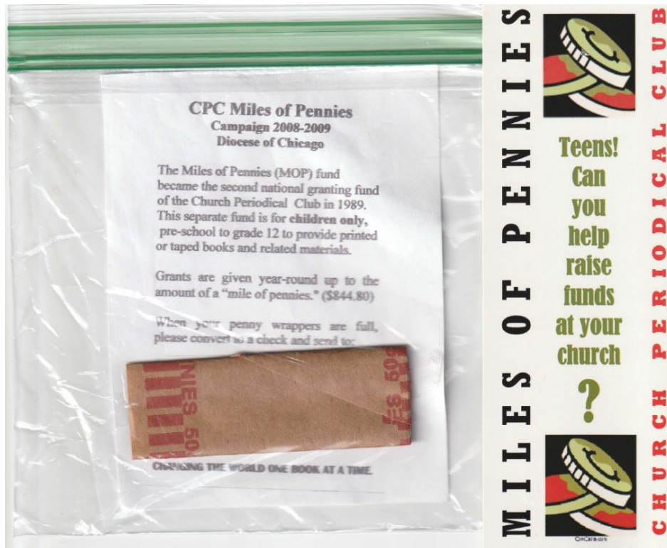
Miles of Pennies Kit and Bookmark