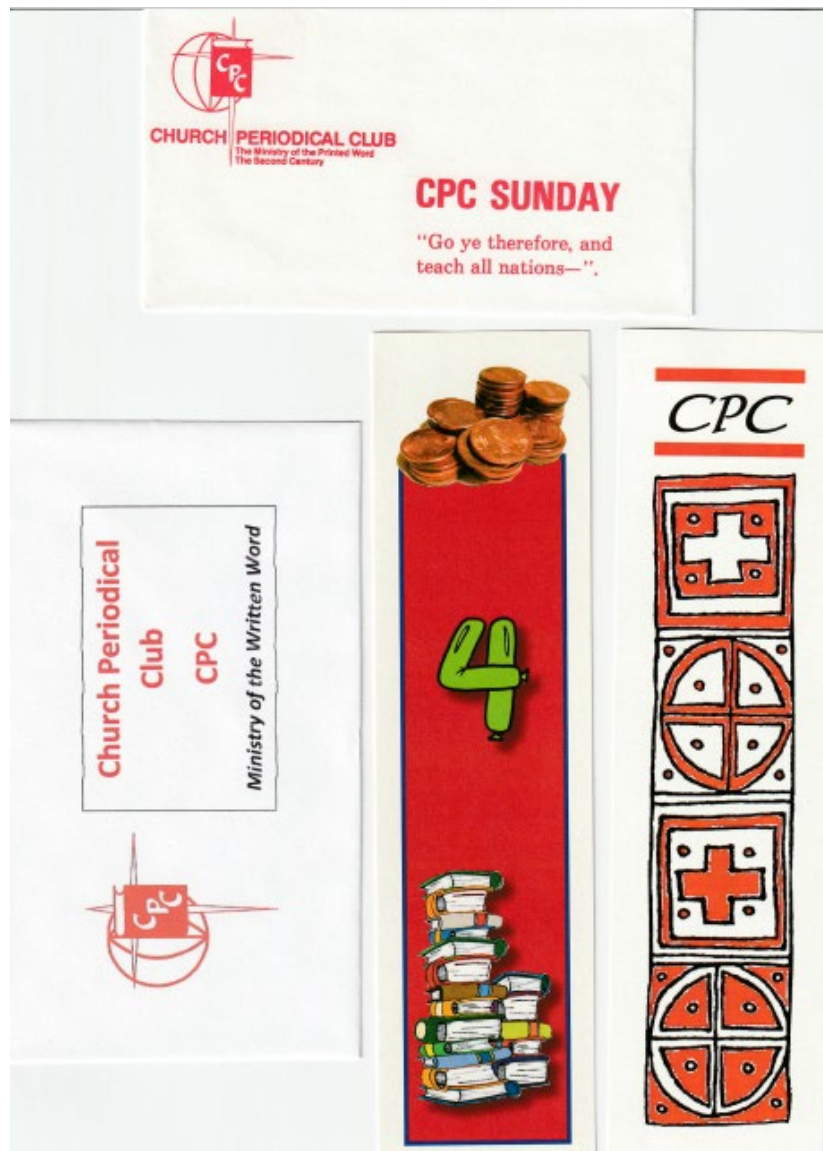
Historic CPC Sunday Envelopes and Bookmarks