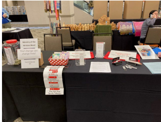
The CPC exhibit at the DOK Triennial meeting