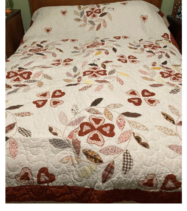
1/24/2025 3:47 PM